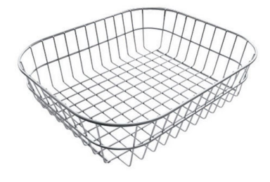
Stainless steel basket 8611 000

8159 101 * only in combination with the accessory 8644 101