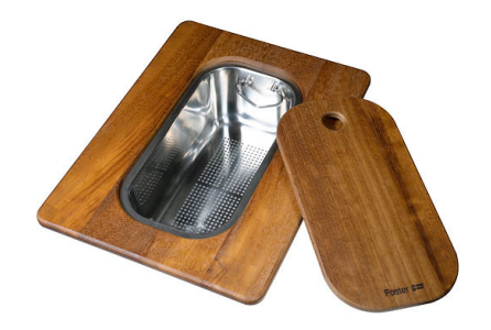
Iroko-wood sliding chopping board with stainless steel colander 8644 044